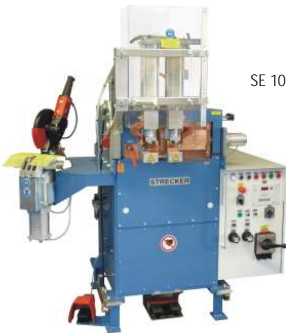
SE 100 G

Flashfree welds on stranded conductors by means of glass, ceramic or graphite tubes